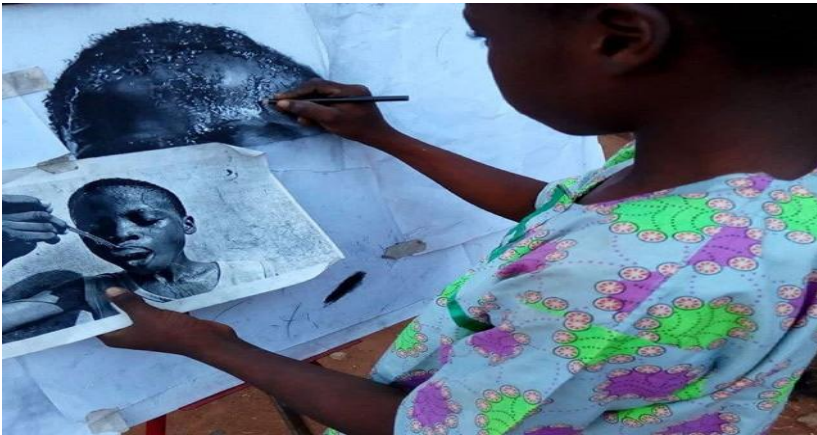
Figure 6. Olamilekan's hyperrealist drawing of a boy feeding with a spoon. Source https://www.instagram.com/waspa_art/

Looking at the drawings of Olamilekan, our purpose is to clearly explain how the works project and define the shades of his creative vision and how his works differ from Idoko's. For this purpose, we are adopting an interpretive assessment approach and the variables we have selected as the basis of our analysis are compositional propriety, novelty, emotional allure, communicative value, aesthetic sensitivity, expressivity, and the quality of artistry. Looking at the communicative value and expressivity, we can categorize Olamilekan's selected drawings as literal and simple in their narrative ambiance. The drawings speak to the viewers and it is not difficult to decode the messages. We also categorize the message as not metaphorical. In reading the narrative message in the drawings, we see in Figure 5 a representation of a boy squeezing a water sachet pack vigorously with both hands as he attempts to drink the water in it. The boy is sweating profusely. This may be because he has been under the scorching sun for a while, or because he has undergone a physically demanding activity. As can be seen from the boy's body hue and hair texture, he is likely of black African descent. His facial gestures and expression suggest exuberance. The drawing shows compositional propriety, communicative value, aesthetic sensitivity, and expressivity, which define the quality of artistry.