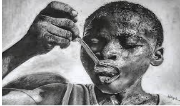
Figure 7. Olamilekan's hyperrealist drawing of a boy feeding with a spoon.

suggests the intensity of physical exertion or exposure to a hot and humid environment, typical of sub-Saharan climatic conditions. The boy's manner of eating suggests a carefree and indifferent disposition, which is part of the emotive ambiance. This drawing thus exhibits compositional propriety, communicative value, emotional allure, aesthetic sensitivity, and expressivity, which define the quality of artistry.