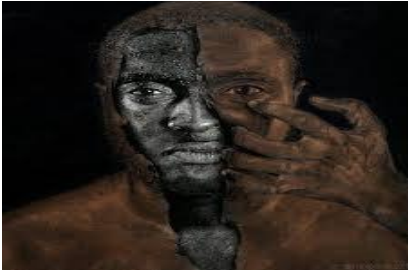
Figure 1 is 'Twist of Fate 1' produced in 2016. Medium: razorblade, sandpaper, charcoal on wood, size 24 x 25 inches 8mm thick.

such as the Moniker Art Fair in New York, the Common Thread Exhibition in London, and the Omenka Gallery at Ikoyi, Lagos, Nigeria. His superlative artistic creative vision began to manifest as a secondary school student in Lagos with his experimentations with pen, charcoal, pastel, and pencil before he adopted a unique application of razorblade, sandpaper, and burner, as his adapted tools in his creation of pyrographic art on wood (which means writing with fire).