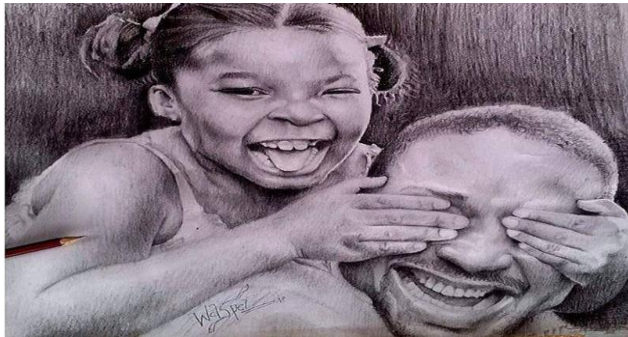
Figure 8, a girl on the back of a man giggling by Olamilekan. Source https://www.instagram.com/waspa_art/

Figure 8 presents a giggling girl on a man's back. This is a literal and simple narrative drawing. The features of the girl and the man suggest that they are apparently of black African descent. The girl playfully covers the eyes of the man with her palms, as both appear to be in a happy mood because they are laughing. The individuals we showed in this drawing similarly suggest that the man supposedly may be the girl's father, uncle, or elder brother based on the appreciable