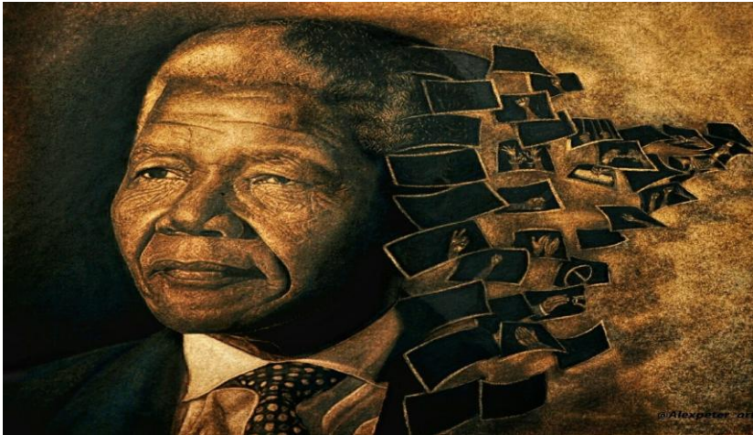
Figure 3. 'Footprints in the Sand' 2017. Medium: razorblade, sandpaper on wood, size: 30 x 35 inches, 8mm thick.

of South Africa. A frame in the third set symbolizes the time Mandela began to encourage reconciliation after his release from twenty-seven years of imprisonment, as he became South Africa's first black president. There is another frame showing one hand with two fingers pointing upwards whilst the rest of the fingers are folded firmly. This image is a victory sign. It indicates progression, solidarity, and recognition of intent for a peaceful atmosphere and reconciliation. A frame with a hand attempting to fix a ring on a finger extended by another hand signifies Mandela's marriage after his release from prison. This frame provides a flashback to the incidences in his marriage life, from the time he began his prison time to the period of his release. The frame is significant because Mandela had to remarry at the end of his prison term because his subsisting marriage collapsed.