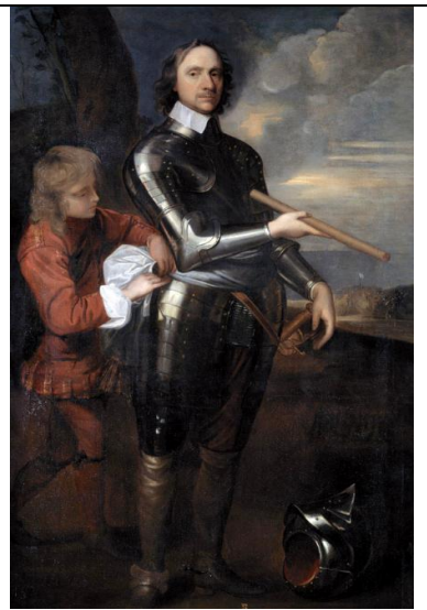
Figure no. 2. Portrait of Oliver Cromwell, Lord Protector of England (after Robert Walker, 1650)