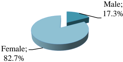
Figure 1: Gender of participants from Al-Hussein bin Talal University library users

Figure 2 shows the qualification degrees of respondents. The least average percentage was 9.6% for Master’s Degree group. 13.5% of participants are holding Diploma, and the majority 76.9 of the participants are holding Bachelor’s Degree.