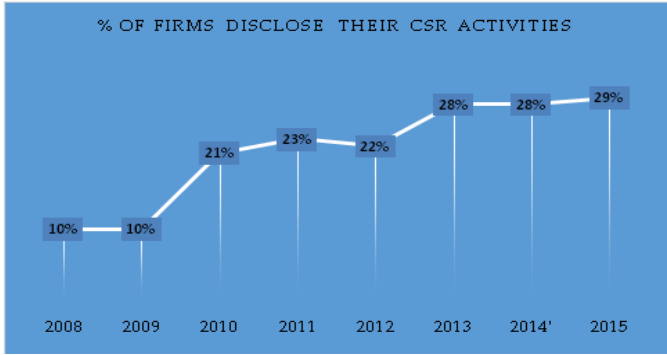
Figure 1: Year Wise Distribution of CSR Disclosure

The above-posed graph shows the current CSR disclosure situation in China. Although it follows the rising trend and gets almost a 150 percent increase over the 8years span as (2008 10%, 2015 29%), CSR practices in China are not matured yet as ten years ago the firms would say that they do not have any responsibility towards as evident by 2008. However, once CSR is included in the law, the number gets higher and higher, as from 2009 to 2010 a 100 percent change in the reporting disclosure. No doubt China is not at the forefront of CSR and the enormous room is available for improvements, but the changing socio-economic landscape of the country can provide a flourishing environment for Corporate Social Responsibility practices in Chinese enterprises.