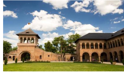
Mogoșoia Palace (restoration)