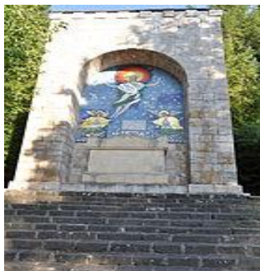
Octavian Goga Mausoleum, Ciucea, Cluj County