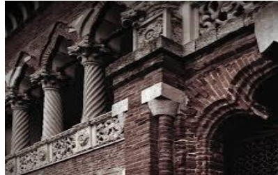
Mogoșoia Palace detail with the Brâncovenesc architectural style ( https://en.wikipedia.org/wiki/Mogoșoia_Palace )

Together with August Schmedigen, he designed the Chrissoveloni Bank Palace in Bucharest (1923-1928), in Renaissance style, which still imparts an air of stateliness and elegance.