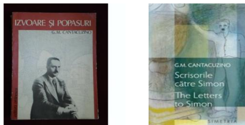
Book covers of Sources and Stopovers and The Letters to Simon