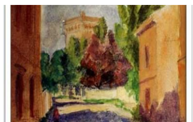
G. M. Cantacuzino’s watercolors (Acuarele G. M. Cantacuzino | Arhitectura)

It’s worth noting that George Matei Cantacuzino had several painting exhibitions of aquarelles and sketches in Bucharest, between 1931 and