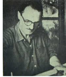
George Matei Cantacuzino, photos