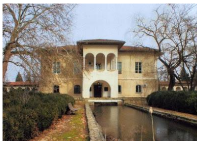
Villa Nae Ionescu, Bucharest