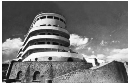
Bellona Hotel (1934) in Eforie Nord, Constanța County

Bellona Hotel represents one of the masterpieces of the Romanian architect who „frequently made use of metaphoric shapes to endow the built space with meaning” (Ibid.). The form seems to be a ship ready for water launching. The construction has an optimal distribution of rooms and functions. Two diachronic principles are applied: the Palladio’s one to highlighting the landscape, and the functionalist language through the mechanical analogy of porthole windows and booths organized in a modernist architecture overall concept. The vertical axis assures the connection „from bow to stern”. A fair balance between fullness and emptiness, and also the existence of terraces as mediation between the inside and outside demonstrate once again the classical spirit with regional particularities G. M. Cantacuzino has cultivated.