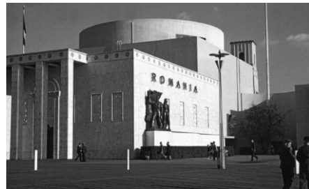
Romania Pavilion at the New York World's Fair (1939-1940)

The elevation in three registers and the marble tiles from the elegant natural stones of Rușchița, the interior perforated boards of Brâncovenesc style, the ogival arch of the entry, the middle foyer bordered by skylights on top and the engraving iconographic map of Romania are just a few elements speaking about the beauty, grace and spiritual flourishing of Romanian society between the wars. Modern elements meet Roman and Byzantine motifs of the central plan and arches, in a classic harmony.