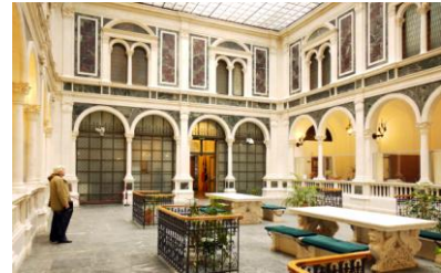
Chrissoveloni Bank Palace, Lips cani Street, Bucharest: the outside of the building and the main hall (Category: Chrissoveloni Bank Palace)