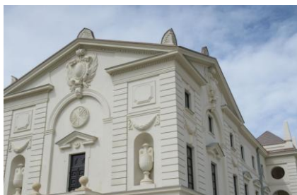
G. M. Cantacuzino's Pavilions of the Metropolitan Cathedral, Iași

The entire work at the Metropolitan Cathedral of Iași is a model of simple architecture of Palladian style with elegant proportion, using the benefits of the natural landscape, and perfectly integrating itself in the Romanian “city on seven hills”: Iași.