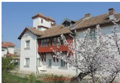
„Casa Mărțișor” / Tudor Arghezi Memorial House, Bucharest